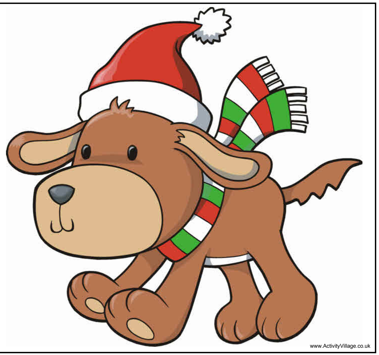
www.ActivityVillage.co.uk - Keeping Kids Busy